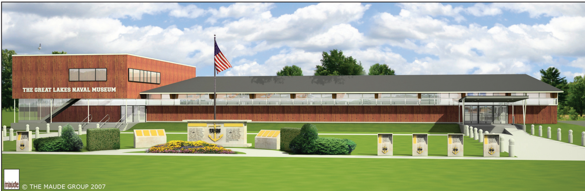
Above and left, artists renderings of Bldg. 42 restored as a naval museum.