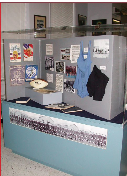
Far right, there are many displays about the history of WAVES at Great Lakes, where many received their initial training.