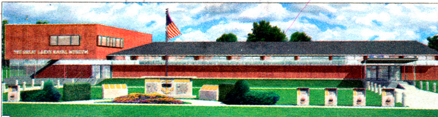
GREAT LAKES NAVAL MUSEUM ASSOCIATION